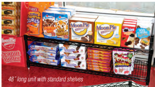
48" long unit with standard shelves